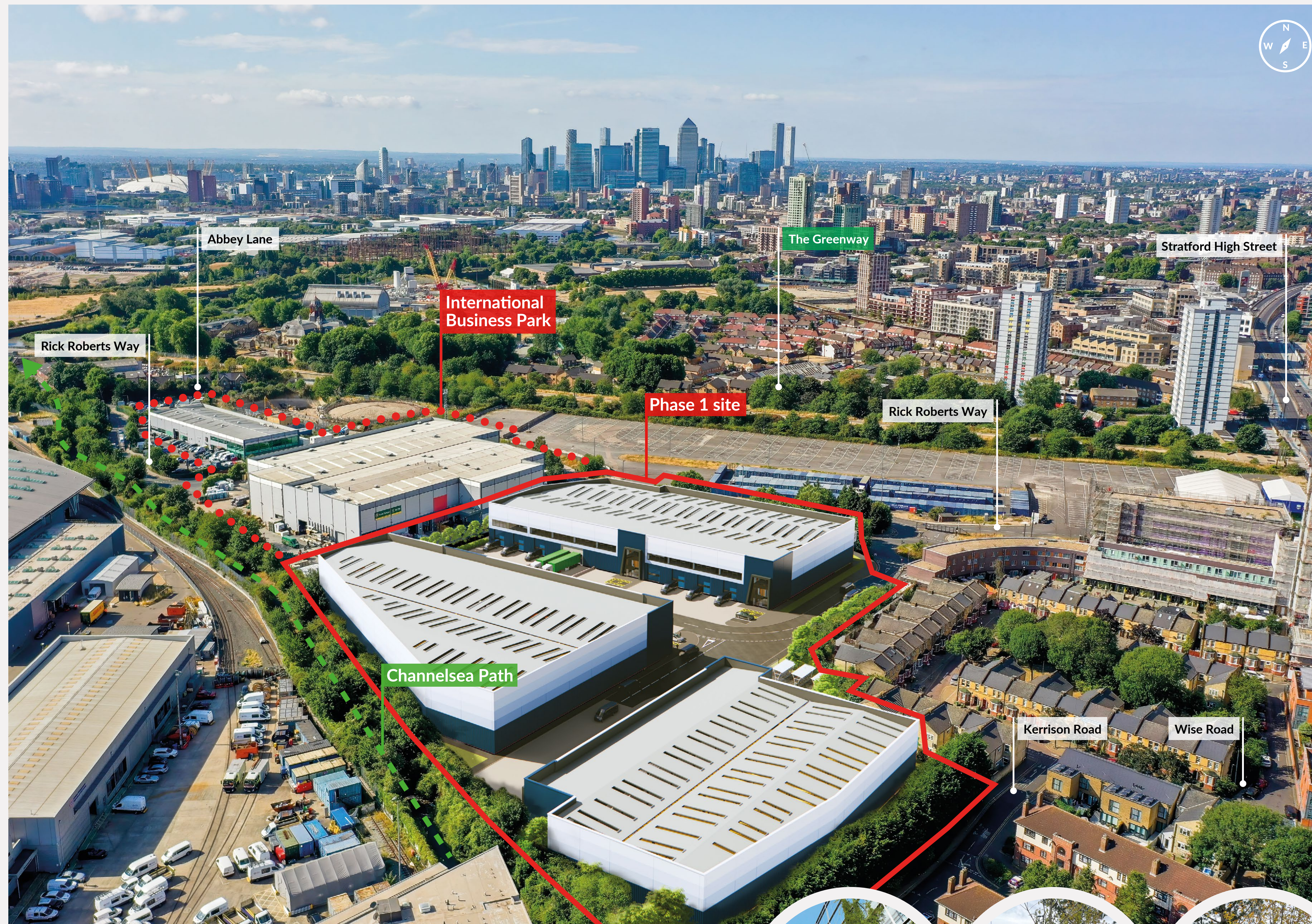
CGI aerial view of the new Phase 1 development

We appreciate that a project of this nature may present some challenges and we want to work with our closest neighbours to manage these as best as possible. You can find further information on some of the measures we're exploring on board 7.