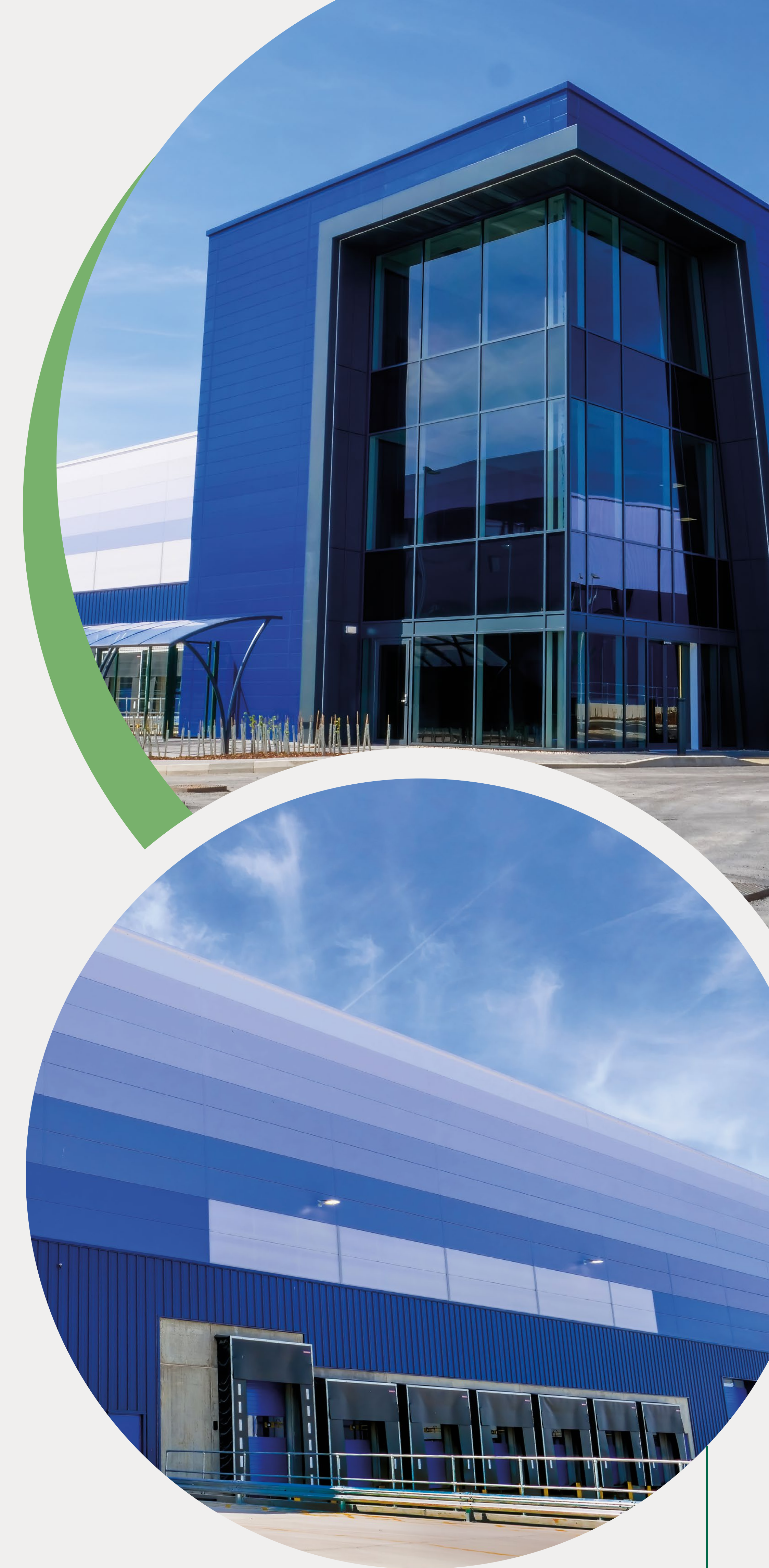
Logistics projects previously delivered by GLP

It is a major employer, supporting at least 3.8 million people nationally