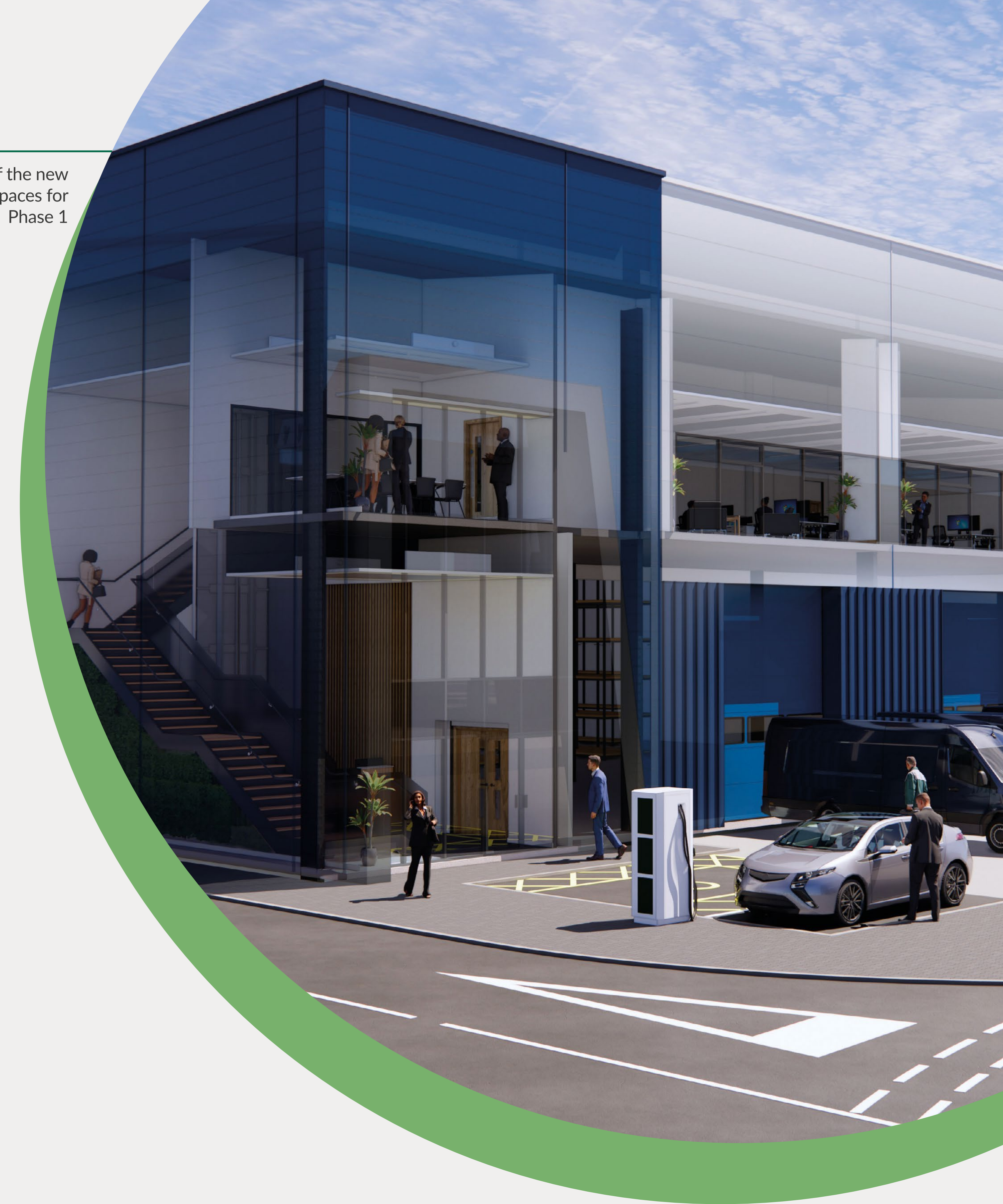
CGI of the new workspaces for Phase 1

more per year for logistics, industrial and commercial jobs