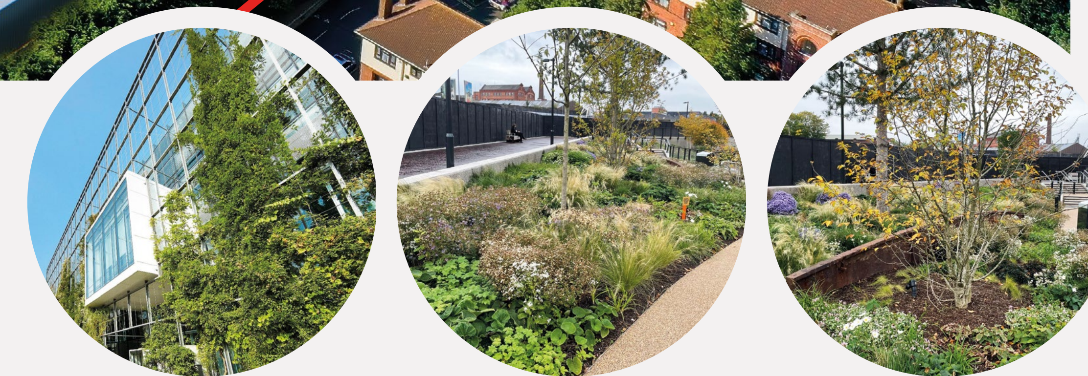
Public realm and landscape improvements proposed as part of the Phase 1 development